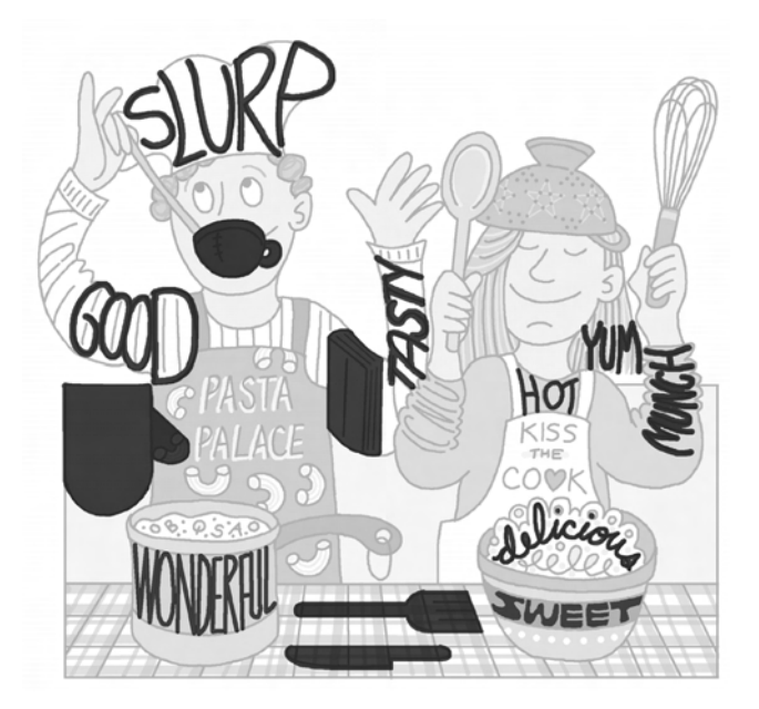
page 174 • Silly Chefs

Jumbo Travel Activity Book Copyright © 2007, F+W Publications, Inc. Used by permission of Adams Media, an F+W Publications Company. All rights reserved.