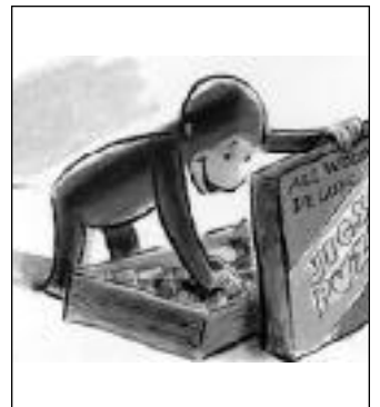
The box is