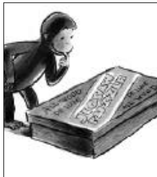
The box is