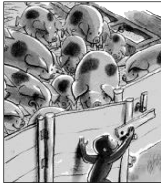
The pigs are the pen.